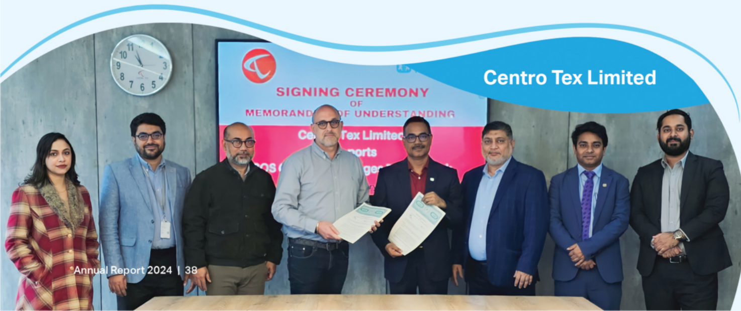
Centro Tex Limited

Impact: Improved child nutrition enhanced cognitive and physical development, and stronger foundations for lifelong learning.